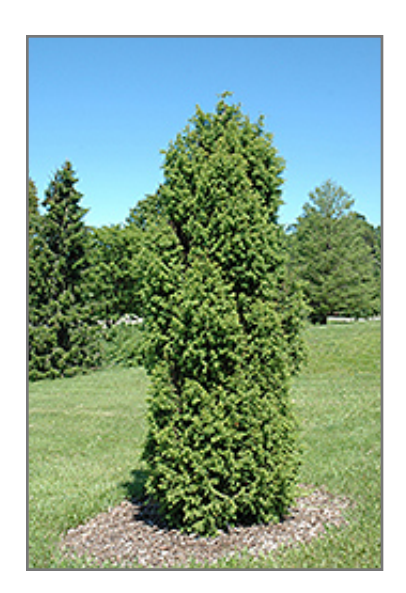
Pencil Point Juniper