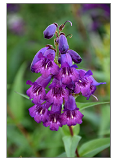
Sour Grapes Beard Tongue flowers

Sour Grapes Beard Tongue has masses of beautiful spikes of purple tubular flowers rising above the foliage from early summer to mid fall, which are most effective when planted in groupings. The flowers are excellent for cutting. Its narrow leaves remain green in colour throughout the season.