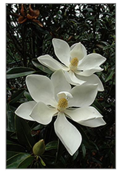
Little Gem Magnolia flowers

Little Gem Magnolia is recommended for the following landscape applications;