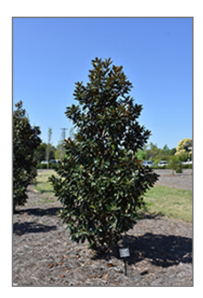
Little Gem Magnolia