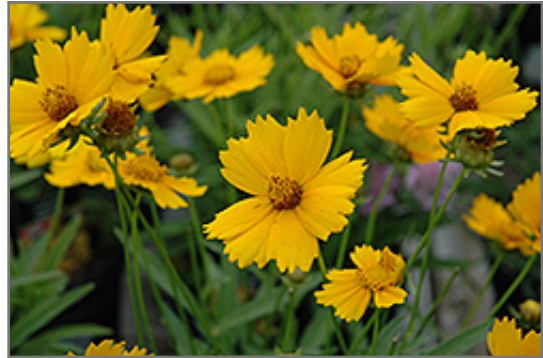
Baby Sun Tickseed flowers