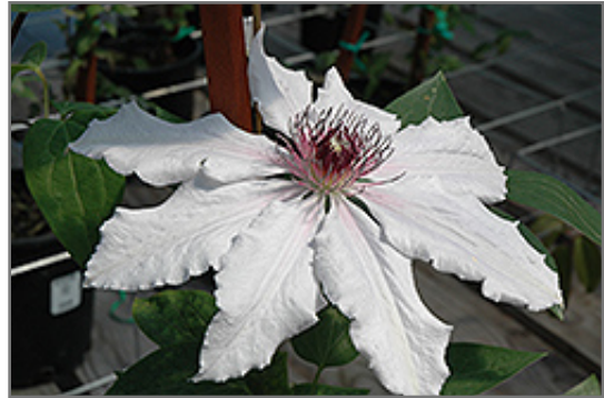
Snow Queen Clematis flowers