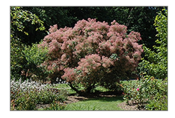
Grace Smokebush in bloom

An excellent large garden shrub valued for its brilliant orange and red fall foliage, large flowers and pink inflorescences which produce a fuzzy, smoky appearance throughout summer, hence the name; a very large shrub, use accordingly