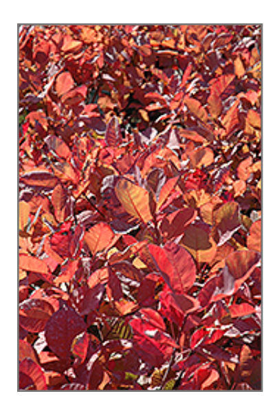
Grace Smokebush in fall

This shrub should only be grown in full sunlight. It is very adaptable to both dry and moist locations, and should do just fine under average home landscape conditions. It is not particular as to soil type or pH. It is highly tolerant of urban pollution and will even thrive in inner city environments, and will benefit from being planted in a relatively sheltered location. This particular variety is an interspecific hybrid.