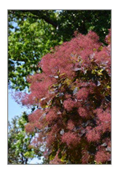
Grace Smokebush flowers

This shrub will require occasional maintenance and upkeep, and is best pruned in late winter once the threat of extreme cold has passed. Deer don't particularly care for this plant and will usually leave it alone in favor of tastier treats. It has no significant negative characteristics.