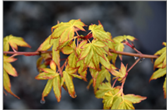
Ueno Homare Japanese Maple foliage

Ueno Homare Japanese Maple is recommended for the following landscape applications;