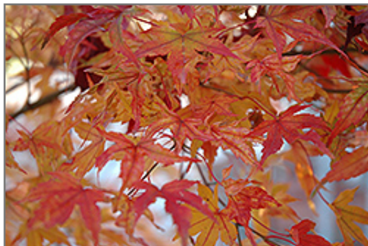
Butterfly Variegated Japanese Maple in fall

Butterfly Variegated Japanese Maple will grow to be about 12 feet tall at maturity, with a spread of 12 feet. It has a low canopy with a typical clearance of 2 feet from the ground, and is suitable for planting under power lines. It grows at a slow rate, and under ideal conditions can be expected to live for 60 years or more.