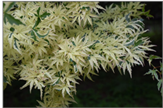
Butterfly Variegated Japanese Maple foliage

Butterfly Variegated Japanese Maple is recommended for the following landscape applications;