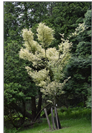
Butterfly Variegated Japanese Maple in bloom