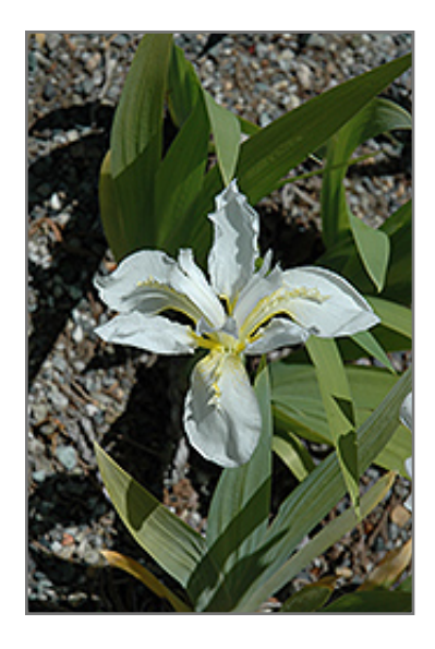
White Japanese Rooftop Iris flowers