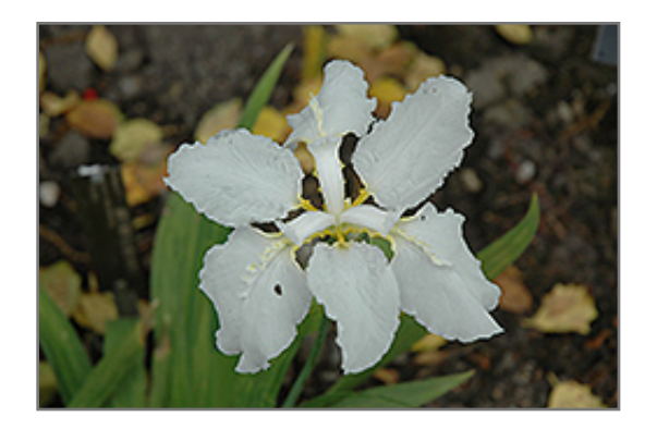
White Japanese Rooftop Iris flowers