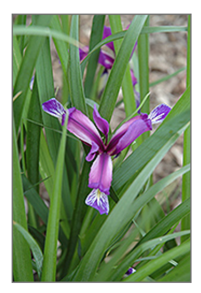
Plum Scented Iris flowers

Plum Scented Iris features dainty fragrant purple flag-like flowers at the ends of the stems from late spring to early summer. The flowers are excellent for cutting. Its small sword-like leaves remain green in colour throughout the season.