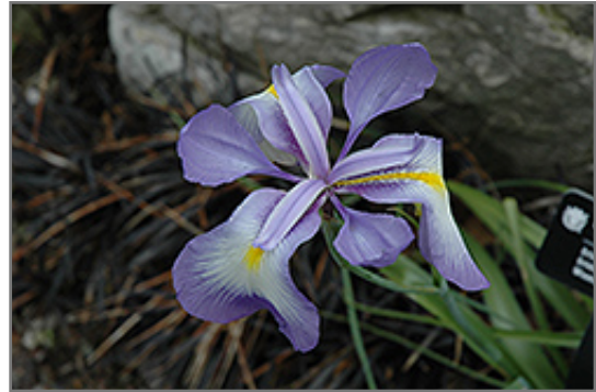
Juno Iris flowers

Juno Iris features showy lightly-scented violet flag-like flowers with white overtones and a yellow blotch at the ends of the stems from late spring to early summer. The flowers are excellent for cutting. Its sword-like leaves remain green in colour throughout the season.