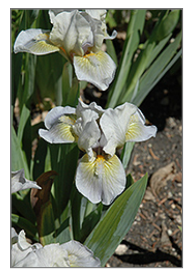
Toy Boat Iris flowers

Toy Boat Iris features showy powder blue flag-like flowers with white overtones and a yellow beard at the ends of the stems in late spring. The flowers are excellent for cutting. Its sword-like leaves remain green in colour throughout the season.