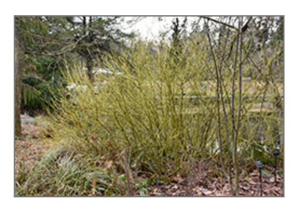
Yellow Twig Dogwood in winter

Yellow Twig Dogwood will grow to be about 8 feet tall at maturity, with a spread of 10 feet. It tends to fill out right to the ground and therefore doesn't necessarily require facer plants in front, and is suitable for planting under power lines. It grows at a fast rate, and under ideal conditions can be expected to live for approximately 20 years.