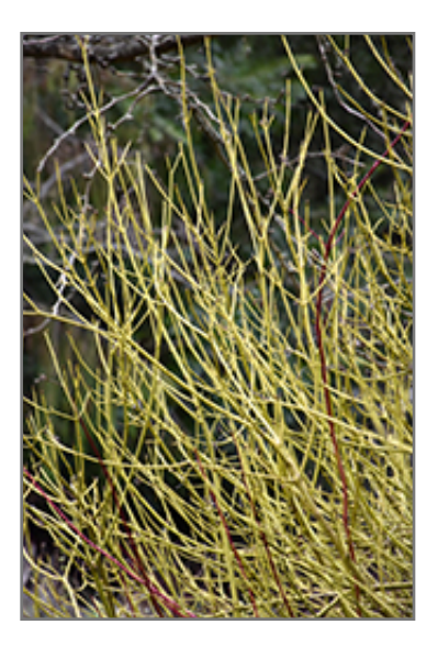
Yellow Twig Dogwood stems

Yellow Twig Dogwood is recommended for the following landscape applications;