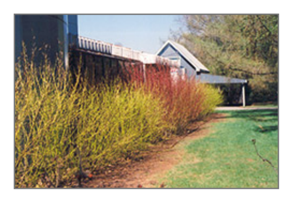
Yellow Twig Dogwood in winter