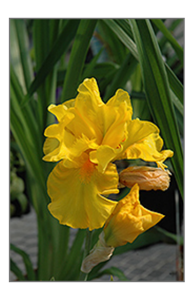
Picasso Moon Iris flowers

Picasso Moon Iris features showy yellow flag-like flowers with a yellow beard at the ends of the stems in mid spring. The flowers are excellent for cutting. Its sword-like leaves remain green in colour throughout the season.