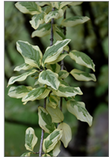
Variegated Cornelian Cherry Dogwood foliage

This is a relatively low maintenance tree, and should only be pruned after flowering to avoid removing any of the current season's flowers. It is a good choice for attracting birds to your yard. It has no significant negative characteristics.