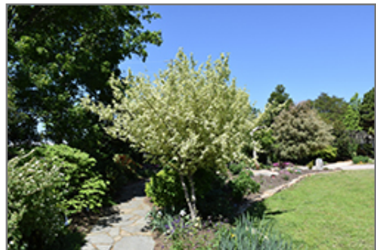
Variegated Cornelian Cherry Dogwood