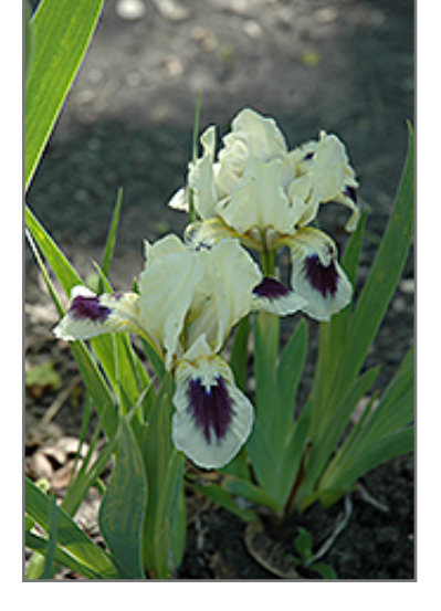
Navy Doll Iris flowers

Navy Doll Iris features showy buttery yellow flag-like flowers with deep purple overtones at the ends of the stems in late spring. The flowers are excellent for cutting. Its sword-like leaves remain green in colour throughout the season.