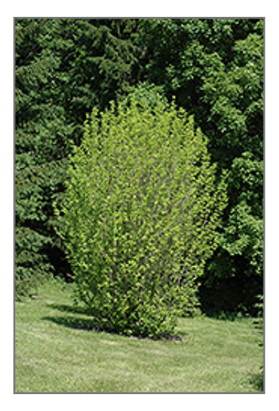
Golden Glory Cornelian Cherry Dogwood

Golden Glory Cornelian Cherry Dogwood is recommended for the following landscape applications;