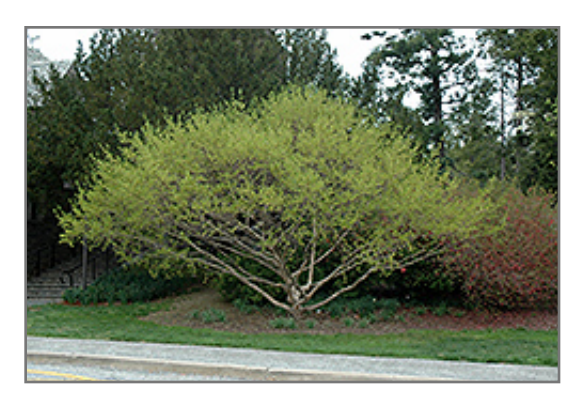
Golden Glory Cornelian Cherry Dogwood in bloom

This tree does best in full sun to partial shade. It is very adaptable to both dry and moist locations, and should do just fine under average home landscape conditions. It is not particular as to soil type or pH. It is somewhat tolerant of urban pollution. Consider applying a thick mulch around the root zone in winter to protect it in exposed locations or colder microclimates. This is a selected variety of a species not originally from North America.