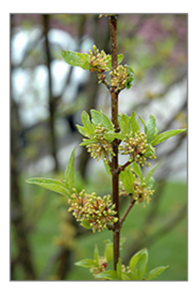
Golden Glory Cornelian Cherry Dogwood flowers