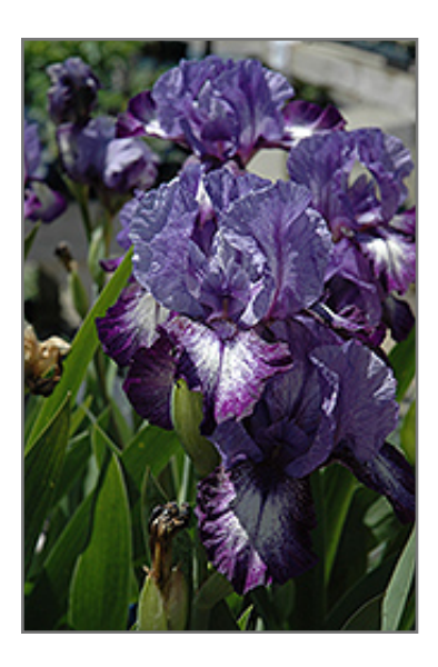
Infinity Ring Iris flowers

Infinity Ring Iris features showy fragrant white flag-like flowers with violet overtones and a blue beard at the ends of the stems in late spring. The flowers are excellent for cutting. Its sword-like leaves remain green in colour throughout the season.