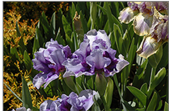
Forever Violet Iris flowers

Forever Violet Iris features showy powder blue flag-like flowers with violet overtones at the ends of the stems in early summer. The flowers are excellent for cutting. Its sword-like leaves remain green in colour throughout the season.