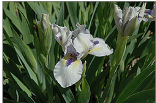
Forever Blue Iris flowers

Forever Blue Iris features showy powder blue flag-like flowers with a blue beard at the ends of the stems in mid spring. The flowers are excellent for cutting. Its sword-like leaves remain green in colour throughout the season.