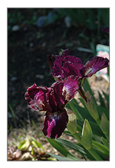
Flight Director Iris flowers

Flight Director Iris features showy burgundy flag-like flowers with yellow overtones at the ends of the stems in mid spring. The flowers are excellent for cutting. Its sword-like leaves remain green in colour throughout the season.