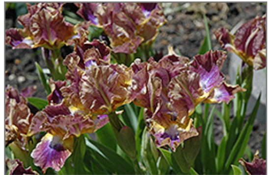
Cyclops Iris flowers

Cyclops Iris features showy yellow flag-like flowers with violet overtones and violet falls at the ends of the stems in late spring. The flowers are excellent for cutting. Its sword-like leaves remain green in colour throughout the season.