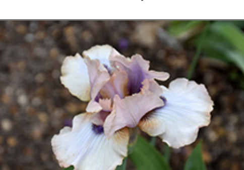
Concertina Iris flowers

This plant will require occasional maintenance and upkeep, and should only be pruned after flowering to avoid removing any of the current season's flowers. Deer don't particularly care for this plant and will usually leave it alone in favor of tastier treats. Gardeners should be aware of the following characteristic(s) that may warrant special consideration;