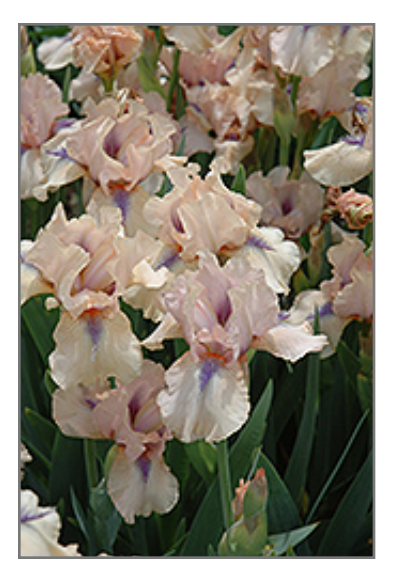
Concertina Iris flowers