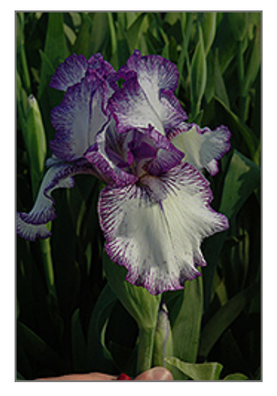
Bold Print Iris flowers

Bold Print Iris features showy white flag-like flowers with purple edges at the ends of the stems in late spring. The flowers are excellent for cutting. Its sword-like leaves remain green in colour throughout the season.