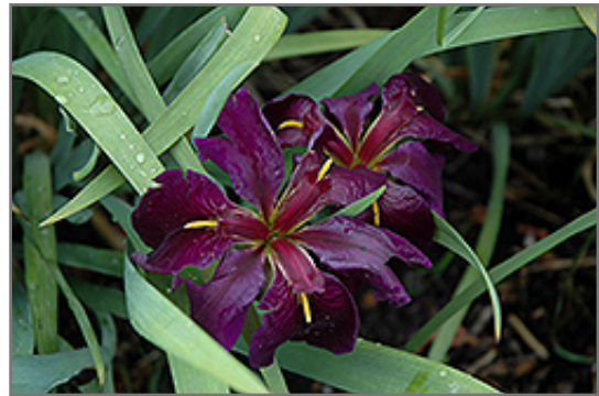
Black Gamecock Iris flowers

Black Gamecock Iris features showy deep purple flag-like flowers with burgundy overtones at the ends of the stems in early summer. The flowers are excellent for cutting. Its sword-like leaves remain green in colour throughout the season.