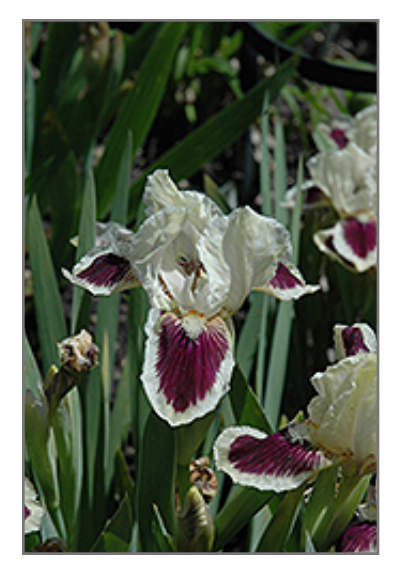
Black Cherry Delight Iris flowers

Black Cherry Delight Iris features showy white flag-like flowers with purple falls at the ends of the stems in late spring. The flowers are excellent for cutting. Its sword-like leaves remain green in colour throughout the season.