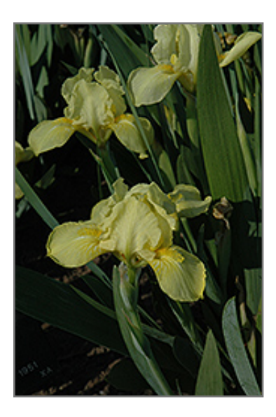
Baria Iris flowers

Baria Iris features showy lemon yellow flag-like flowers at the ends of the stems from late spring to early summer. The flowers are excellent for cutting. Its sword-like leaves remain green in colour throughout the season.