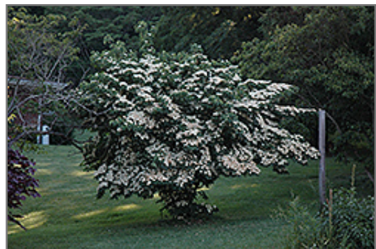
Milky Way Chinese Dogwood in bloom