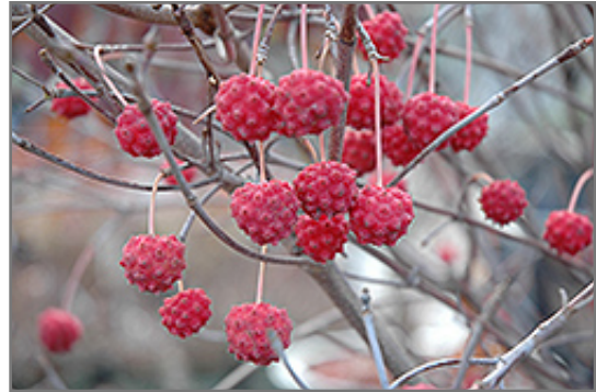
Milky Way Chinese Dogwood fruit

This tree does best in full sun to partial shade. It does best in average to evenly moist conditions, but will not tolerate standing water. It is very fussy about its soil conditions and must have rich, acidic soils to ensure success, and is subject to chlorosis (yellowing) of the foliage in alkaline soils. It is somewhat tolerant of urban pollution, and will benefit from being planted in a relatively sheltered location. Consider applying a thick mulch around the root zone in winter to protect it in exposed locations or colder microclimates. This is a selected variety of a species not originally from North America.