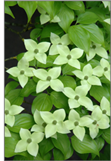
Milky Way Chinese Dogwood flowers

This is a relatively low maintenance tree, and should only be pruned after flowering to avoid removing any of the current season's flowers. It is a good choice for attracting birds to your yard. It has no significant negative characteristics.