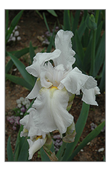
Announcement Iris flowers

Announcement Iris features showy lavender flag-like flowers with shell pink overtones and a gold beard at the ends of the stems in late spring. The flowers are excellent for cutting. Its sword-like leaves remain green in colour throughout the season.