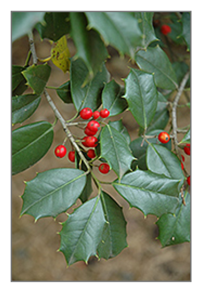
Miss Helen American Holly fruit