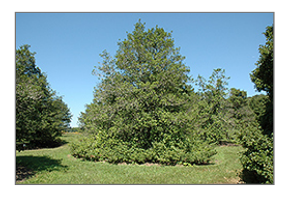
Miss Helen American Holly

Miss Helen American Holly is recommended for the following landscape applications;