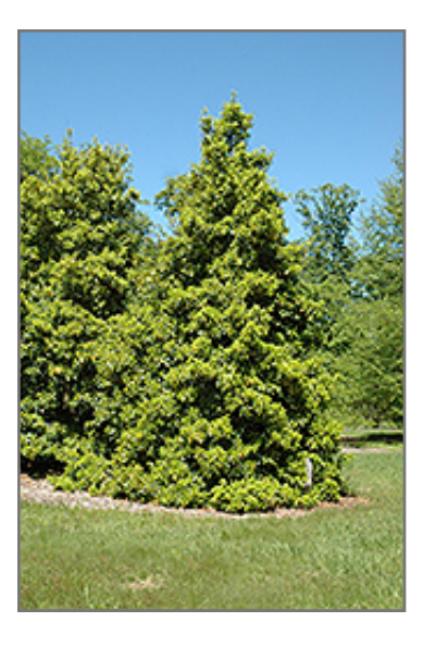
Chief Paduke American Holly

Chief Paduke American Holly is primarily grown for its highly ornamental fruit. It features an abundance of magnificent scarlet berries from mid fall to late winter. It has olive green evergreen foliage. The spiny oval leaves remain olive green throughout the winter.