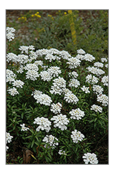
Purity Candytuft flowers