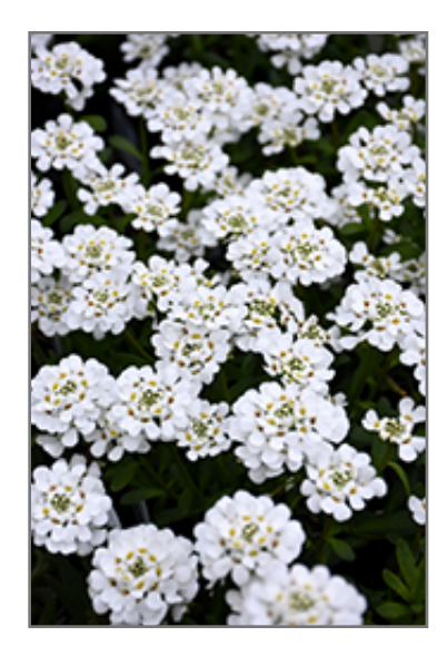
Purity Candytuft flowers