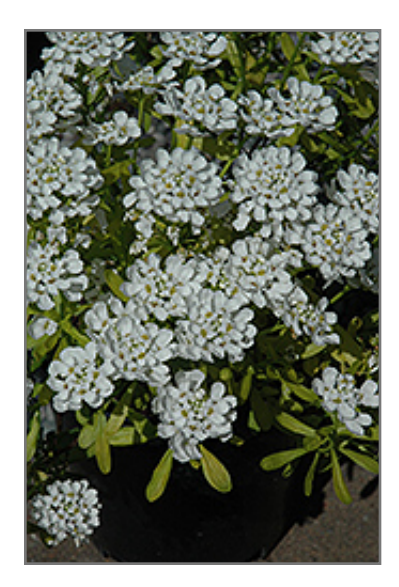
Golden Candy Candytuft flowers