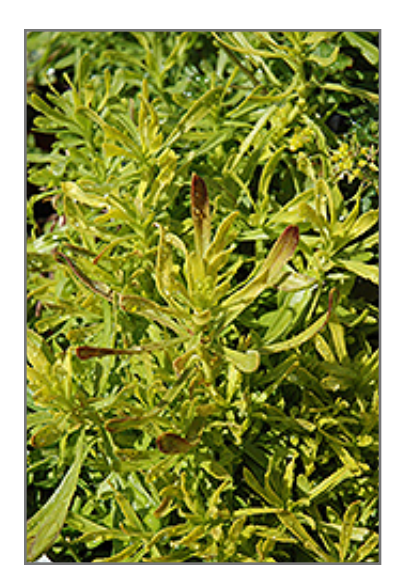
Golden Candy Candytuft foliage