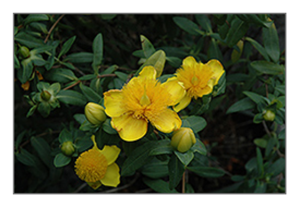
Sunburst St. John's Wort flowers

Beautiful bright yellow buttercup flowers with bushy stamens blanket the attractive oblong sea-green leaves in summer; widely adaptable but thrives in moist, well-drained soil