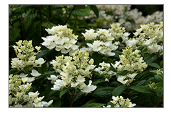
White Diamonds Hydrangea flowers

This shrub performs well in both full sun and full shade. It prefers to grow in average to moist conditions, and shouldn't be allowed to dry out. It is not particular as to soil type or pH. It is highly tolerant of urban pollution and will even thrive in inner city environments. Consider applying a thick mulch around the root zone in winter to protect it in exposed locations or colder microclimates. This is a selected variety of a species not originally from North America.