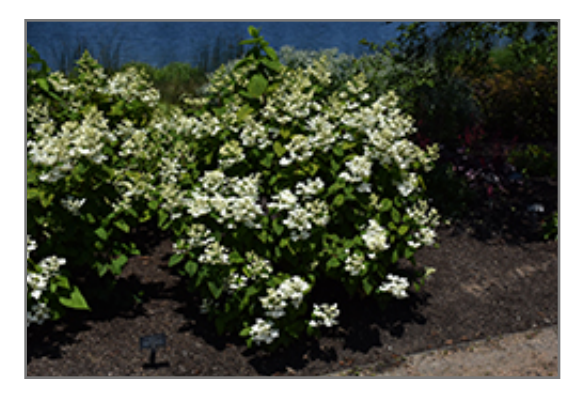
White Diamonds Hydrangea in bloom