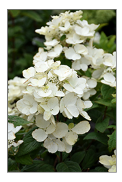
White Diamonds Hydrangea flowers