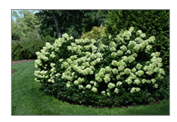
Little Lime Hydrangea in bloom

This shrub performs well in both full sun and full shade. It prefers to grow in average to moist conditions, and shouldn't be allowed to dry out. It is not particular as to soil type or pH. It is highly tolerant of urban pollution and will even thrive in inner city environments. Consider applying a thick mulch around the root zone in winter to protect it in exposed locations or colder microclimates. This is a selected variety of a species not originally from North America.