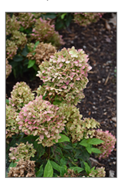
Little Lime Hydrangea flowers (faded)