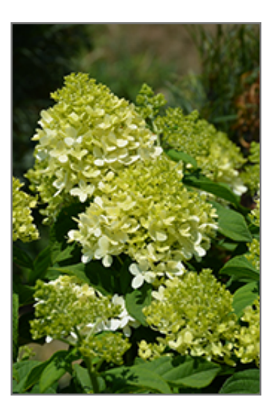
Little Lime Hydrangea flower buds