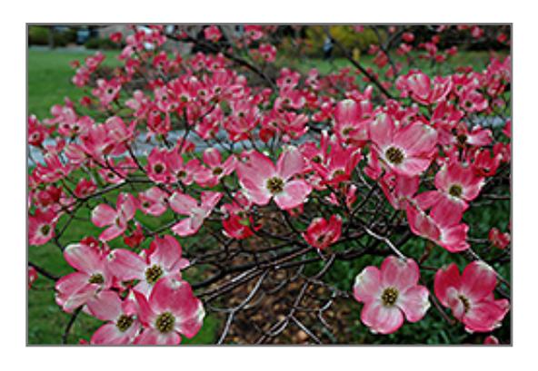
Red Beauty Flowering Dogwood flowers

A beautiful specimen tree, famous for its delicate bright red blooms in spring and compact, spreading form; extremely fussy, requires rich, well-drained acidic soil and adequate precipitation, best with some shelter