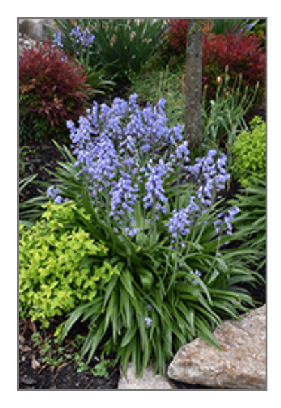
Spanish Bluebell in bloom

Spanish Bluebell is recommended for the following landscape applications;