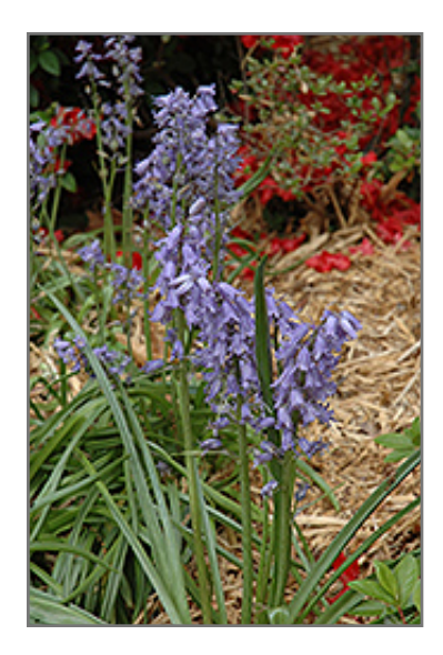
Spanish Bluebell flowers