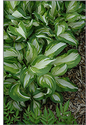
Variegated Hosta foliage