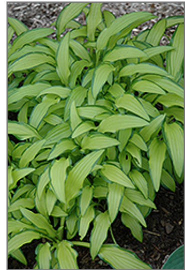
Kabitan Hosta

Kabitan Hosta is recommended for the following landscape applications;