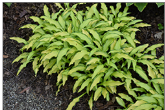
Kabitan Hosta