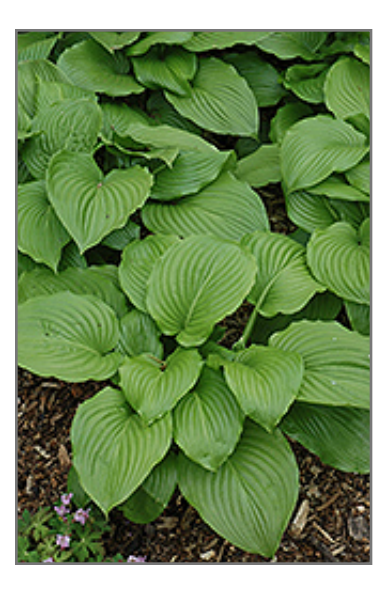
August Lily

Lovely mounds of light green, textured, heart-shaped foliage create a perfect background for shaded borders and gardens; fragrant white flowers appear on arching scapes during the mid summer; adds texture and contrast; low maintenance and easy to grow