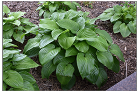
Plantain Lily