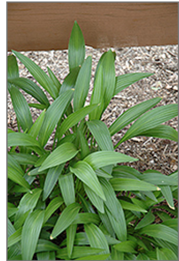
Long Leaf Hosta