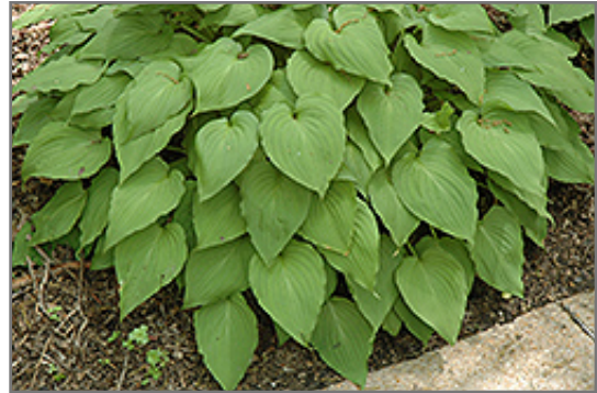
Tall Hosta foliage