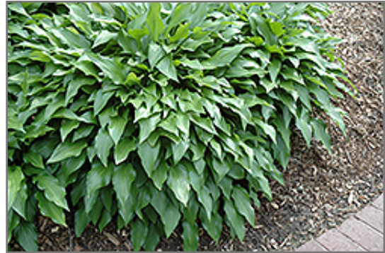
Autumn Wind Chinese Hosta