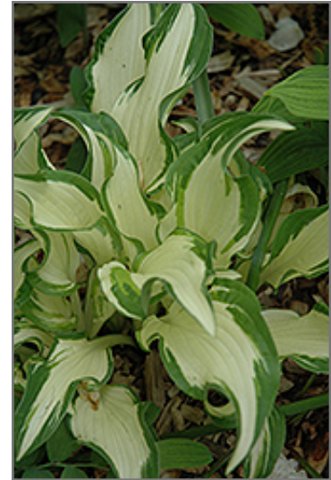
White Elephant Hosta foliage