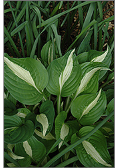
White Bikini Hosta foliage