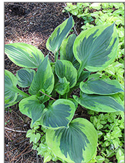
Twilight Hosta