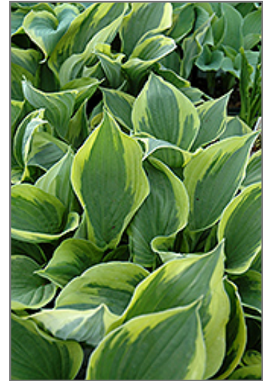
Twilight Hosta foliage

Twilight Hosta is recommended for the following landscape applications;