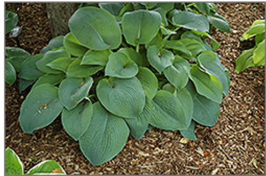
True Blue Hosta