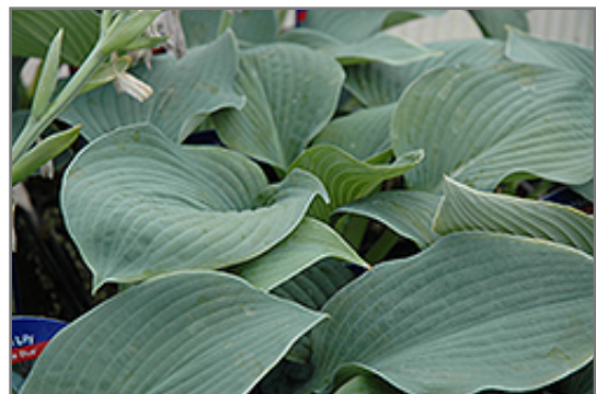
True Blue Hosta foliage