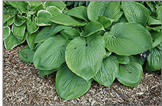
Sum Total Hosta foliage